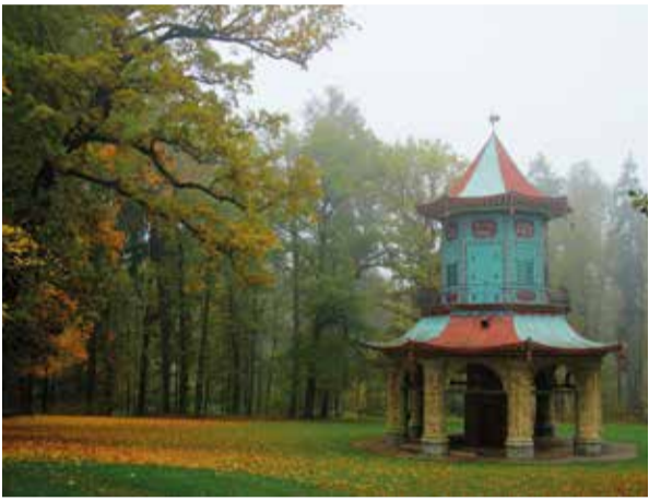
Vlašim chateau park