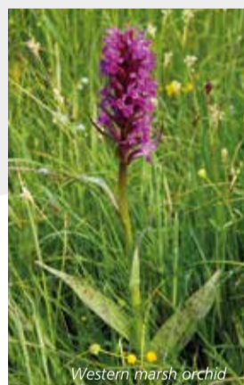
Western marsh orchid