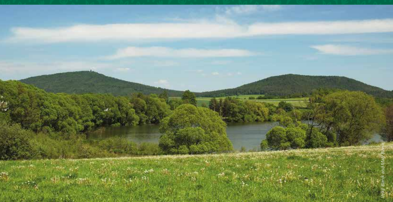
Velký Blaník and Malý Blaník

Welcome to the Blaník Protected Landscape Area, in the heart of the Central Bohemian Uplands, in a proud region with a subtle and balanced beauty. Welcome to a landscape with a mosaic of forests, meadows, fields, small fishponds and preserved meanders of the river Blanice, dominated by the mythical twin hills of Velký Blaník and Malý Blaník, where between streams of boulders, scree and rocks, old beech and spruce trees grow that witnessed the time of the Czech National Revival. Welcome to a landscape of defunct forts and strongholds, Romanesque monuments and villages that still bear the marks of long-gone Hussite wars, in a typical Czech landscape on the border between Central Bohemia and the Czech-Moravian Highlands.