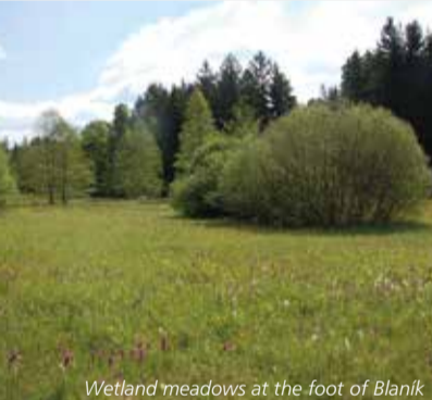
Wetland meadows at the foot of Blaník

Legend has it that an army rests inside Velký Blaník, ready for the nation's worst times. It is headed by the patron saint of Bohemia, king Wenceslaus. When the time is most tense, the dry oak at Blaník will turn green with fresh leaves and the spring underneath it will become so powerful that the well will overflow and the water will start streaming down the hillside. Then the Jamb Rock in the mountain will open, the knights will wake from their deep slumber and headed by the Czech patron saint, they will come out to fight the enemies, defeat them, and peace will be re-established over the Bohemian lands.