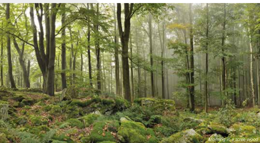
Morning in a scree wood

Welcome to the Blaník Protected Landscape Area, in the heart of the Central Bohemian Uplands, in a proud region with a subtle and balanced beauty. Welcome to a landscape with a mosaic of forests, meadows, fields, small fishponds and preserved meanders of the river Blanice, dominated by the mythical twin hills of Velký Blaník and Malý Blaník, where between streams of boulders, scree and rocks, old beech and spruce trees grow that witnessed the time of the Czech National Revival. Welcome to a landscape of defunct forts and strongholds, Romanesque monuments and villages that still bear the marks of long-gone Hussite wars, in a typical Czech landscape on the border between Central Bohemia and the Czech-Moravian Highlands.