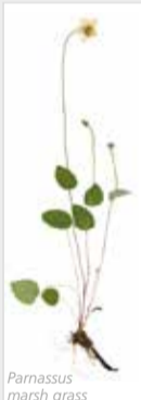
Parnassus marsh grass