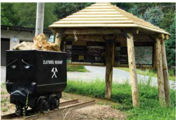
The Gold Mine