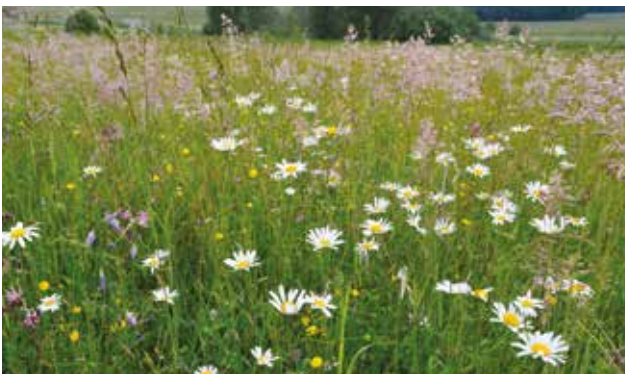
Meadow rich in species