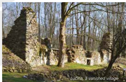
Lučina, a vanished village

The White stork is a typical example of an animal that successfully adapted to changes in the landscape and closely bound its life with people. The bird is also a natural traveller and therefore was chosen as the guide through the Český Les House of Nature exhibition.