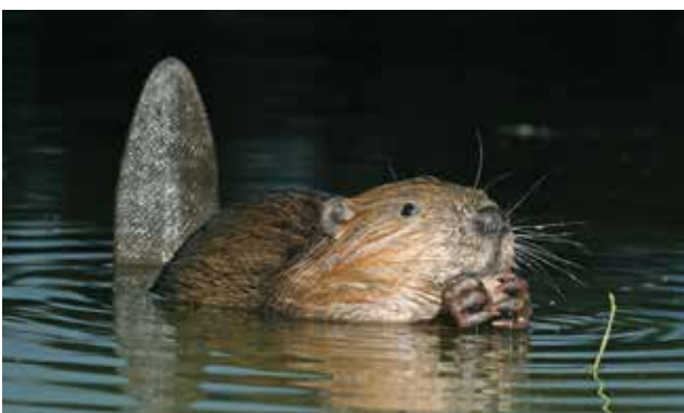
The European beaver