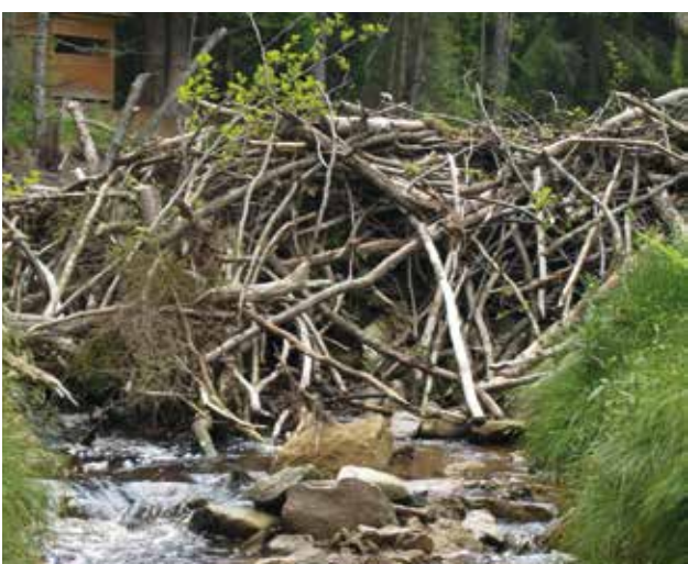
Beaver dam on the Aquatic World nature trail