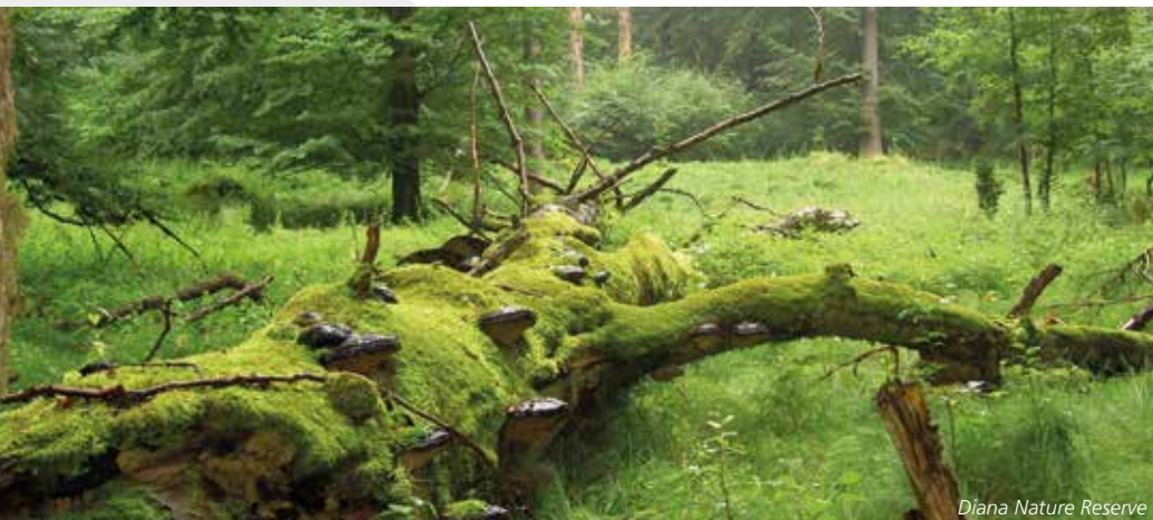
Diana Nature Reserve

Welcome to the landscape of the Český Les (also known as the Upper Palatine Forest or Böhmischer Wald) mountain range. It lies on a strip of forested hills that has always been the natural border between Bohemia and Upper Palatinate (Oberpfalz) in Bavaria, and has preserved many traces from the history of the local landscape. A careful visitor has the opportunity to follow the mutual interaction between nature and man that has taken place here for centuries. As a result of human use, the originally forested landscape developed into a variegated mosaic of places which are home to plant and animal species that would be unable to live in a forested land.