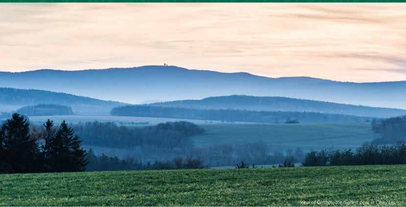
View of Čerchov, the highest peak in Český Les

Welcome to the landscape of the Český Les (also known as the Upper Palatine Forest or Böhmischer Wald) mountain range. It lies on a strip of forested hills that has always been the natural border between Bohemia and Upper Palatinate (Oberpfalz) in Bavaria, and has preserved many traces from the history of the local landscape. A careful visitor has the opportunity to follow the mutual interaction between nature and man that has taken place here for centuries. As a result of human use, the originally forested landscape developed into a variegated mosaic of places which are home to plant and animal species that would be unable to live in a forested land.