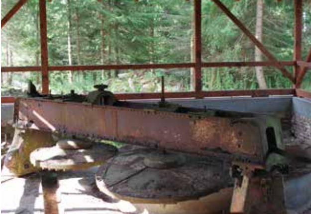
Arnoštova plate glass polishing workshop

This nature trail presents the peat bogs, which can be found in the northern part of Český Les, approx. 1 km south of the road from Lesná to Stará Knížecí Huť. Cars can be parked some 2 km from Lesná at an intersection of roads in the forest. The peat bogs are accessible via a wooden walkway winding through unique bog pine stands. The trail ends in a roofed viewing gallery offering a view of the pools and rare plant species, such as the Labrador-tea, round-leaved sundew and the butterwort.