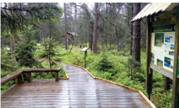
Walkway in peat bogs on the Podkovák nature trail